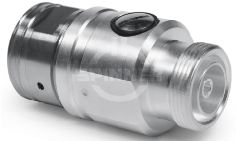
Connector 7-16 socket CAF