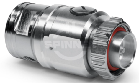
Connector 7-16 plug CAF