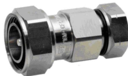
OMNI FIT™ Premium Connectors