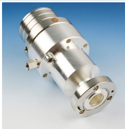
Connector 7/8" EIA