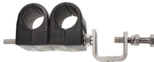
picture shows MBHS78-2-F for illustration purpose