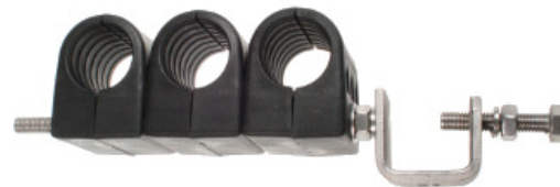
picture shows MBHS78-3-F for illustration purpose