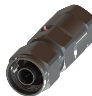
OMNI FIT™ Premium Connectors