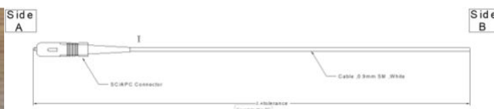
Drawing of a Pigtail