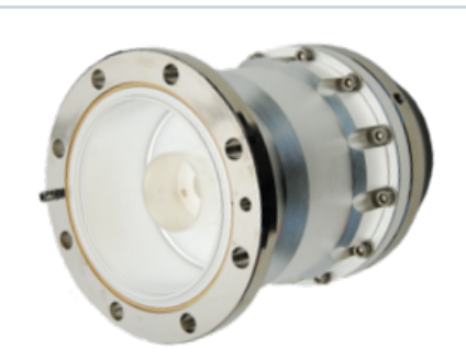
Connector 4-1/2" IEC