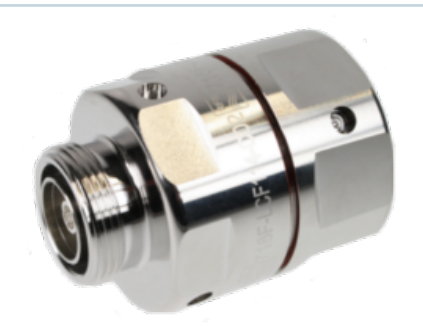
OMNI FIT™ Standard Connectors