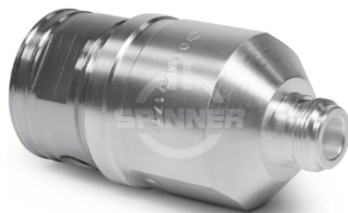
Connector N Socket CAF