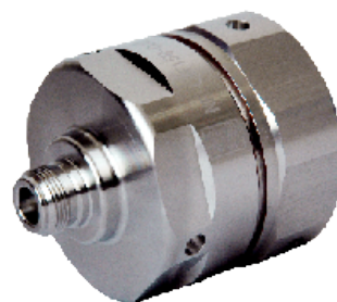
OMNI FIT™ Standard Connectors