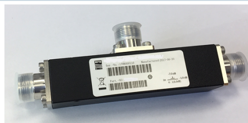
TPS15-43-694/3800 (similar product illustration)