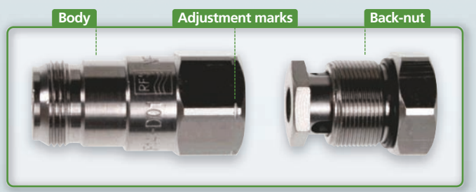
OMNI FIT™ Premium for SCF14 up to SCF12