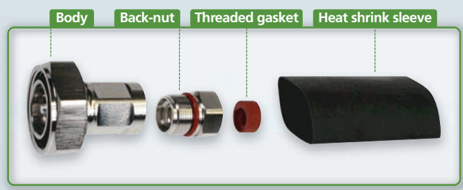
OMNI FIT™ Standard for SCF 12