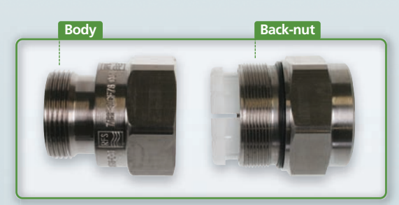
OMNI FIT™ Premium for LCF 14 up to 158