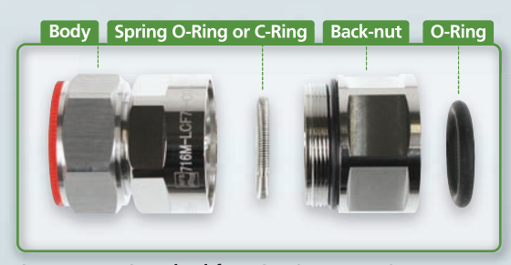
OMNI FIT™ Standard for LCF 12 up to 158