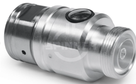
Connector 7-16 socket CAF