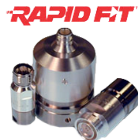
RAPID FIT™ Connectors