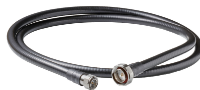
7M43MS12-0600FFP for EXAMPLE

Radio Frequency Systems' CELLFLEX® Factory-Fit Jumpers feature specially designed connectors which are soldered-on in a strictly controlled industrial process to ensure industry leading performance for today's high-performance wireless systems. The connector design and manufacturing process has been optimized to produce premium VSWR and IM levels. Injection molded boots provide reliable and repeatable additional sealing level and strain relief. Our facilities produce and stock all popular lengths as required by the industry, and can deliver custom lengths with premium VSWR and IM levels on request.