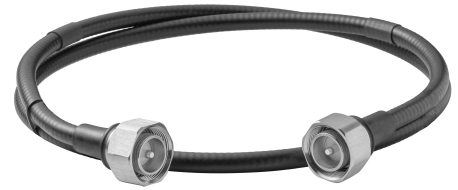
f. e. 43M43MS14-0100FFP

Radio Frequency Systems' CELLFLEX® Factory-Fit Jumpers feature specially designed connectors which are soldered-on in a strictly controlled industrial process to ensure industry leading performance for today's high-performance wireless systems. The connector design and manufacturing process has been optimized to produce premium VSWR and IM levels. Injection molded boots provide reliable and repeatable additional sealing level and strain relief. Our facilities produce and stock all popular lengths as required by the industry, and can deliver custom lengths with premium VSWR and IM levels on request.