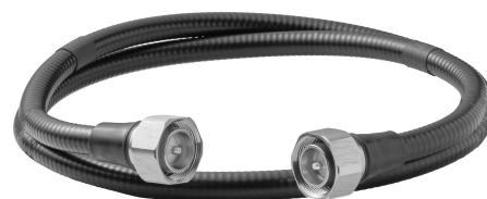
f. e. 43M43MS38-0100FFP