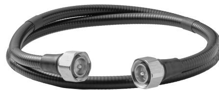
f. e. 43M43MS38-0100FFP

Radio Frequency Systems' CELLFLEX® Factory-Fit Jumpers feature specially designed connectors which are soldered-on in a strictly controlled industrial process to ensure industry leading performance for today's high-performance wireless systems. The connector design and manufacturing process has been optimized to produce premium VSWR and IM levels. Injection molded boots provide reliable and repeatable additional sealing level and strain relief. Our facilities produce and stock all popular lengths as required by the industry, and can deliver custom lengths with premium VSWR and IM levels on request.