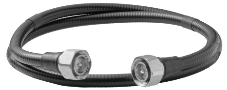
f. e. 43M43MS38-0100FFP

Radio Frequency Systems' CELLFLEX® Factory-Fit Jumpers feature specially designed connectors which are soldered-on in a strictly controlled industrial process to ensure industry leading performance for today's high-performance wireless systems. The connector design and manufacturing process has been optimized to produce premium VSWR and IM levels. Injection molded boots provide reliable and repeatable additional sealing level and strain relief. Our facilities produce and stock all popular lengths as required by the industry, and can deliver custom lengths with premium VSWR and IM levels on request.