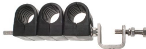
picture shows MBHS78-3-F for illustration purpose