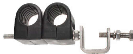
picture shows MBHS78-2-F for illustration purpose