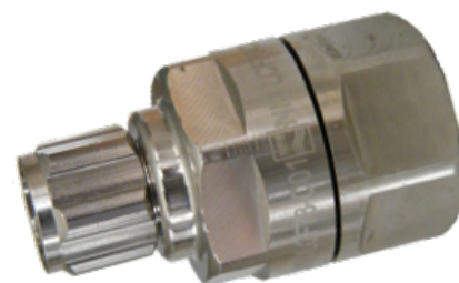
OMNI FIT™ Standard Connectors