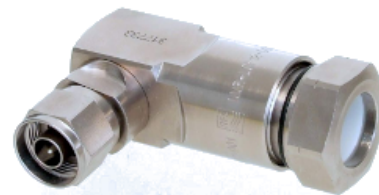
OMNI FIT™ Premium Connectors