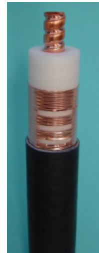
picture shows generic slot pattern