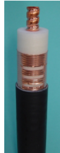
picture shows generic slot pattern