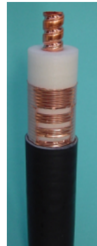
picture shows generic slot pattern