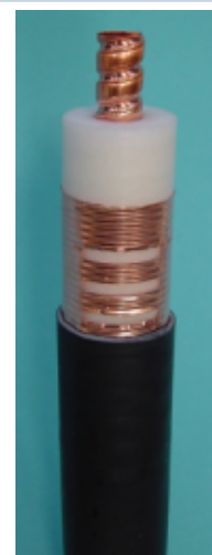
picture shows generic slot pattern