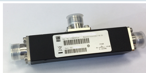
TPS10-43-555/6000 (similar product illustration)

RFS TPS* Tapper product family has been designed to support a variety of wireless applications in the frequency band from 555 to 6000MHz. The units couple off a defined fraction of a RF signal from typically 3 to 30 dB with minimal reflections or loss. The broad frequency range is ideally suited for 3G / 4G / 5G multi-band distributed antenna systems or in combination with RADIAFLEX® radiating cables. Notably, these products feature a low level of network interferences due to their PIM optimized desing.