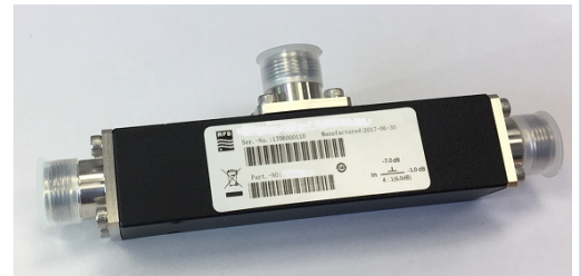
TPS15-43-694/3800 (similar product illustration)

RFS TPS* Tapper product family has been designed to support a variety of wireless applications in the frequency band from 694 to 3800MHz. The units couple off a defined fraction of a RF signal from typically 3 to 30 dB with minimal reflections or loss. The broad frequency range is ideally suited for 3G / 4G / 5G multi-band distributed antenna systems or in combination with RADIAFLEX® radiating cables. Notably, these products feature a low level of network interferences due to their PIM optimized desing.