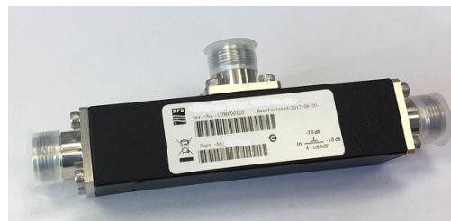
TPS6-43-555/6000 (similar product illustration)