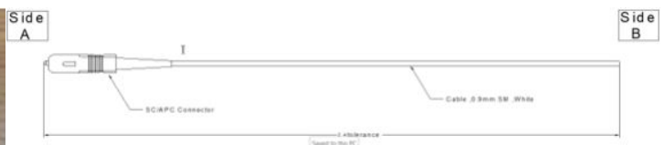
Drawing of a Pigtail