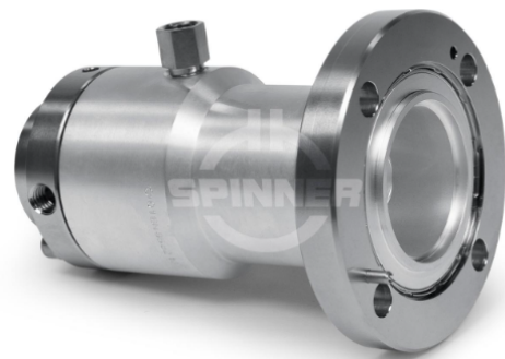
Connector EIA 1 5/8"