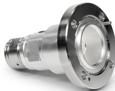
Connector EIA 7/8"