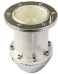
Connector 3-1/8" EIA