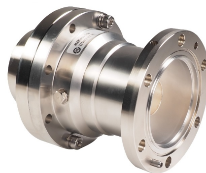
318EIA Connector for HCA300 Cable