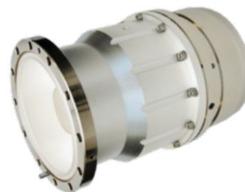
Connector 6-1/8" EIA