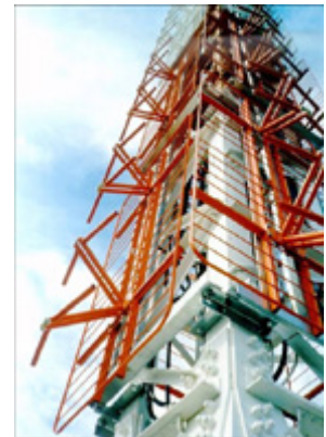
655 and 656 Antenna Series showing 656 Panel Array