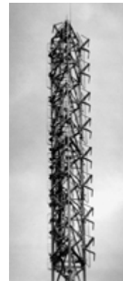
657 and 658 Antenna Series showing 657 Antenna Panel Array