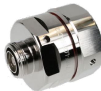
OMNI FIT™ Standard Connectors