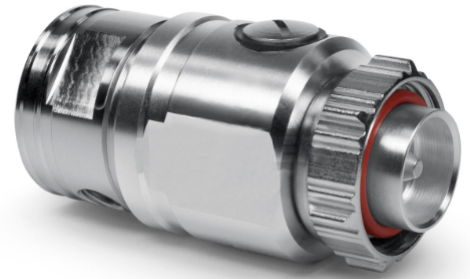
Connector 7-16 plug CAF