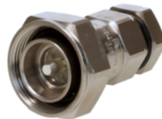
OMNI FIT™ Premium Connectors