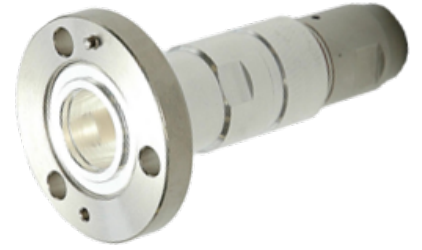
78EIA Connector for HCA58 Cable