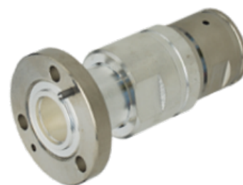
Connector EIA 7/8"