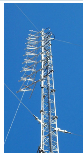
828MP Series showing 828-8 antenna

The wide variety of possible configurations ensures that this antenna range meets the needs of most users on both price and performance.