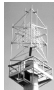
903CP Series showing 903CP-2 Antenna