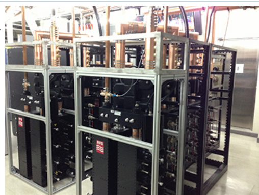
Multi-channel CA8PPXX200E Combiner