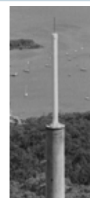
CBS Antenna Series showing CBS7