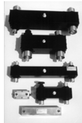
3dB coupler with Type-N connectors