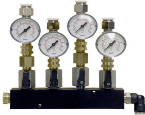
PWM4G : 4-Port Manifold with Pressure Gauges & Check Valves